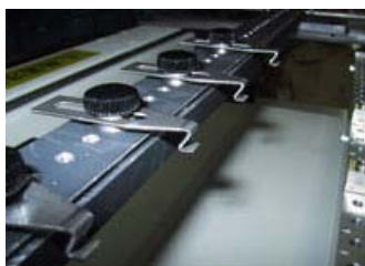
MS9000S-07/09 Board Clamp Jig

It is very important to hold the board firmly in reworking. If it is so, exact and stabilized reworking will be possible. It is the first condition for making reworking successful.