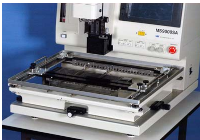
The XY Table of MS9000SA

The XY table of MS9000SA can be remove from the base. And the XY table is equipped with the under support pins system. Therefore, pin positioning of the under the board will be easy, and it could do correctly. It is very convenient in the double-side mounted board.