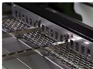
MSC-02WARP Under Support Pins

MS9000SAN holds the board in Z type slot of the X rails. the Z slot is holds of the board and also prevented warp. When the board is complicated form, it holds by the attached board clamp Jig.