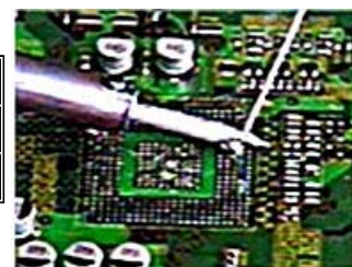
The solder is added