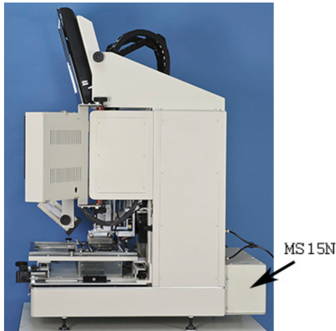
MS9000SAN Rework System + MS15N N2 Gas Generator

The Photograph is attaching of MS15N N2 Gas Generator for MS9000SAN Rework System MS15N is N2 gas generator only for rework system. It can be used with almost all the hot air heating type rework system. And it can connect also for current use rework system. It is very little cost and, moreover, easily get of the heating environment by N2 gas