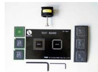
OP-TB01 Cariblation Kit